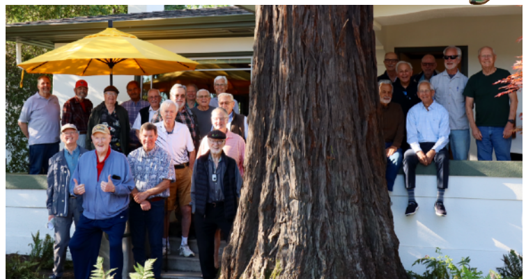
Rianda House Gents