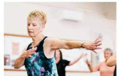
RIANDA HOUSE AT BRANNAN CENTER

Join a chair-based class to breathe, stretch, & reset your body & mind at your own pace. We will be both sitting & standing. RSVP